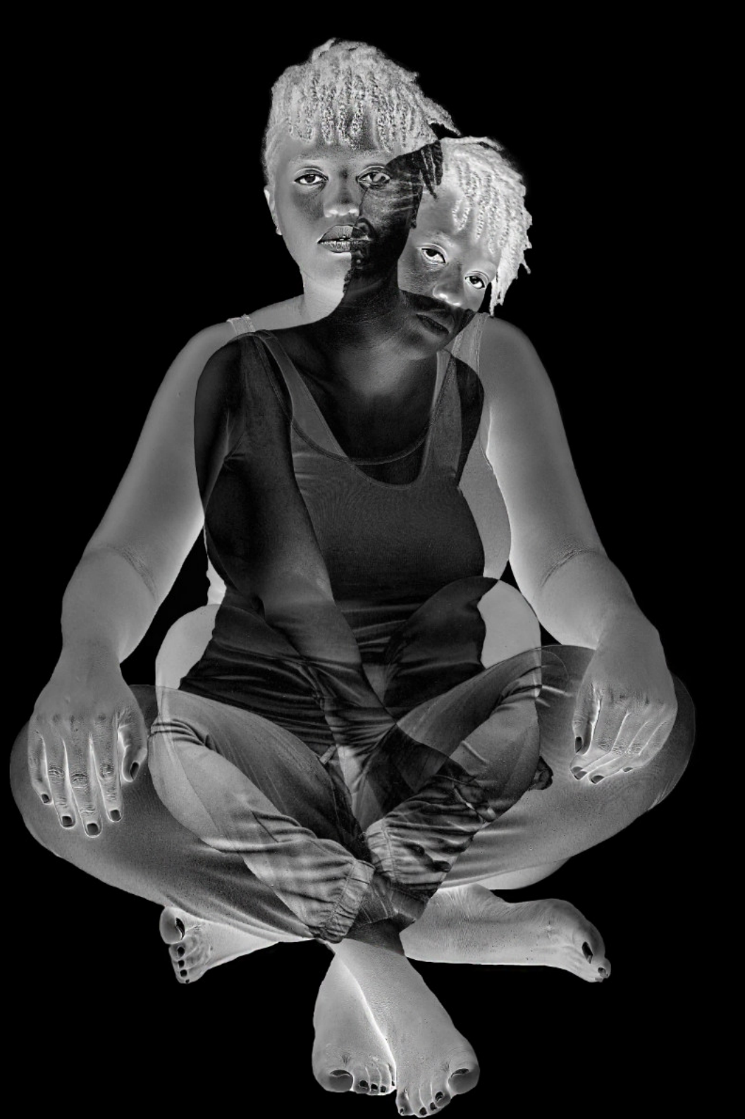
Center: Kokiding, 2023, Digital archive print on canvas, 24 × 36 in | 61 × 91.5 cm