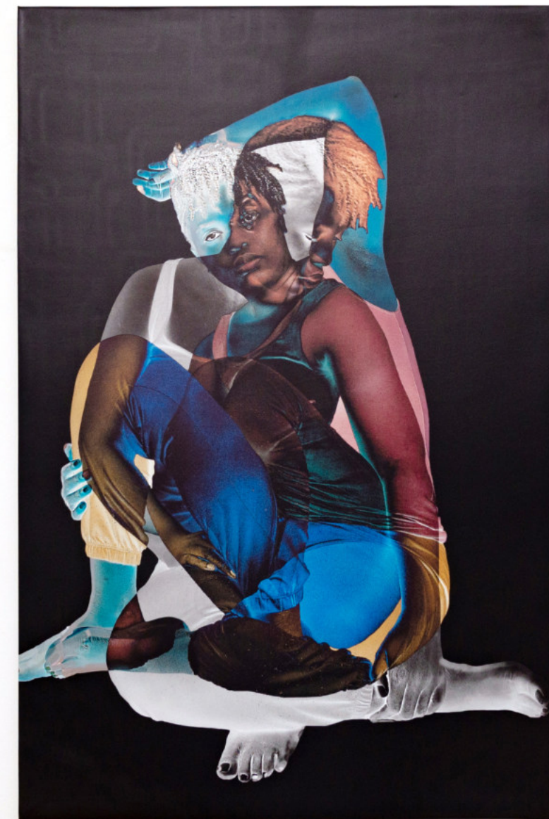
Right: Installation view, ECHOES. Amasaka Gallery, Kampala, 2023