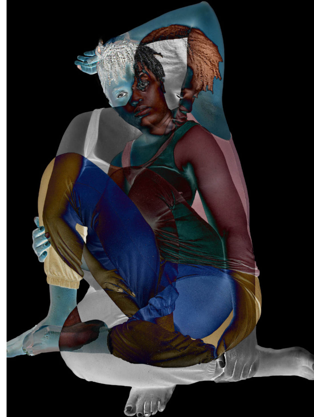
Left: Ameje (I am a deserted place), 2023, digital archive print on canvas, 36 × 24 in, 91.5 × 61 cm