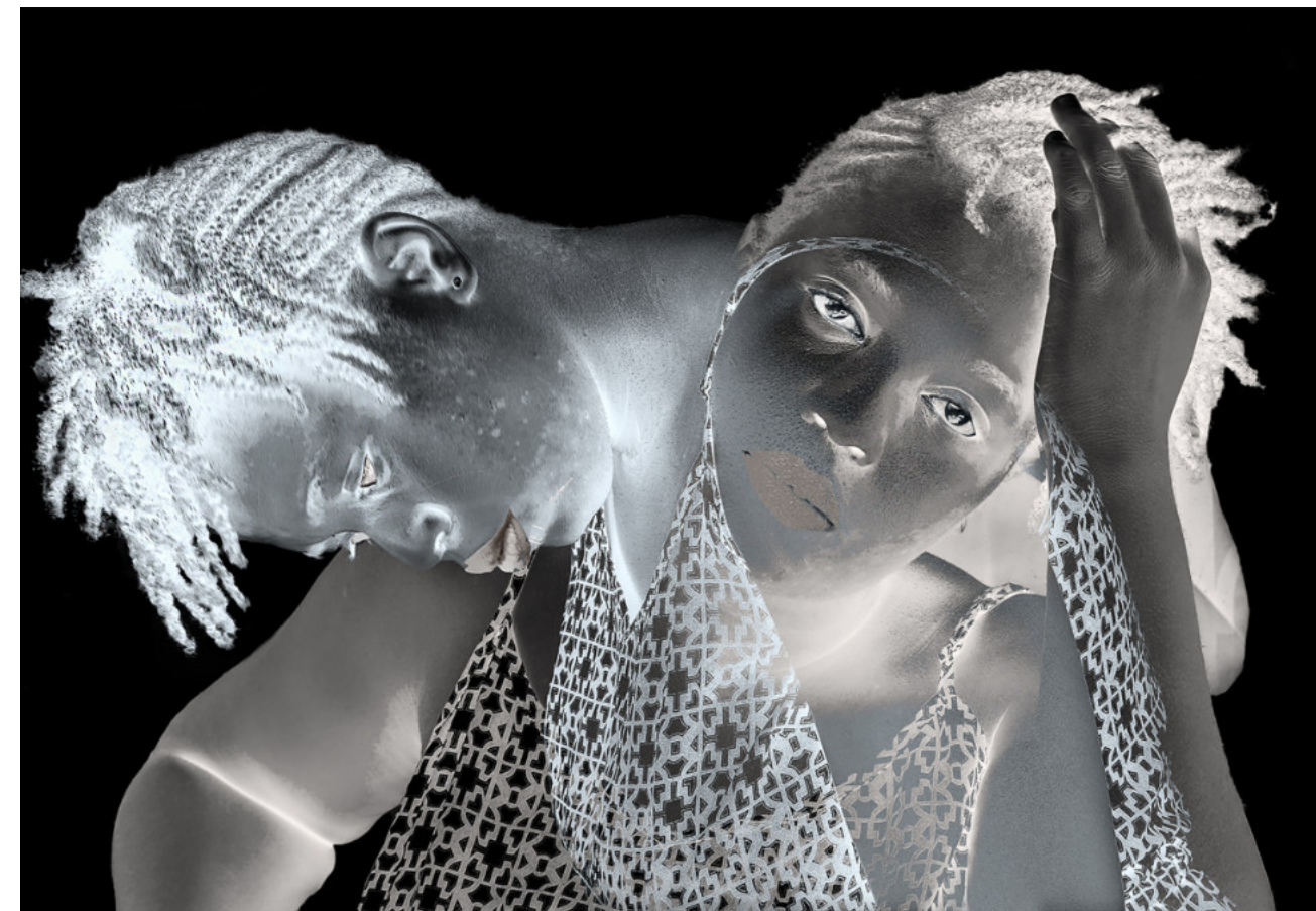
Right: Tiketwana, 2023, Digital archive print on canvas, 24 × 36 in | 61 × 91.5 cm