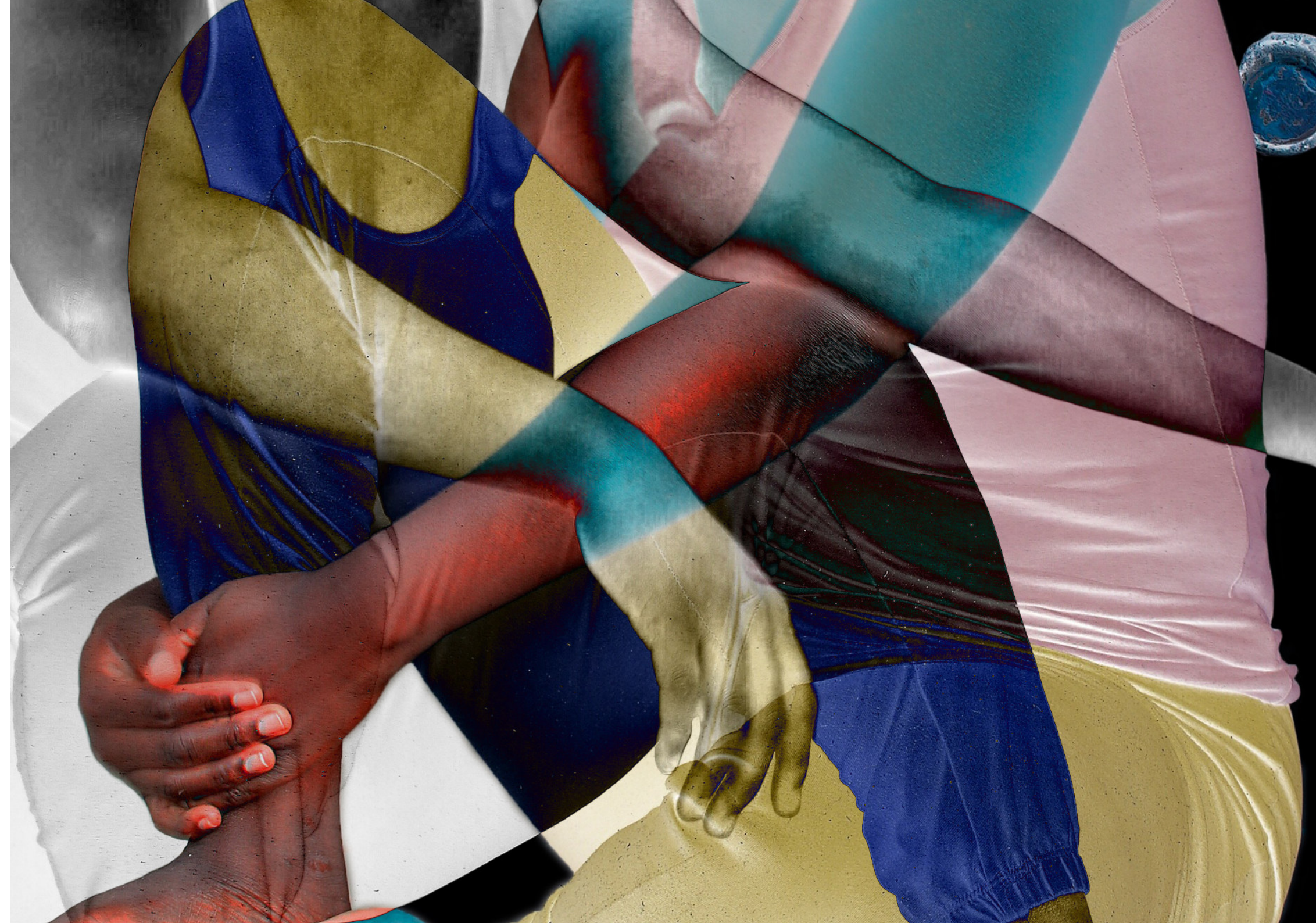
Right: Atikelekari, 2023, detail