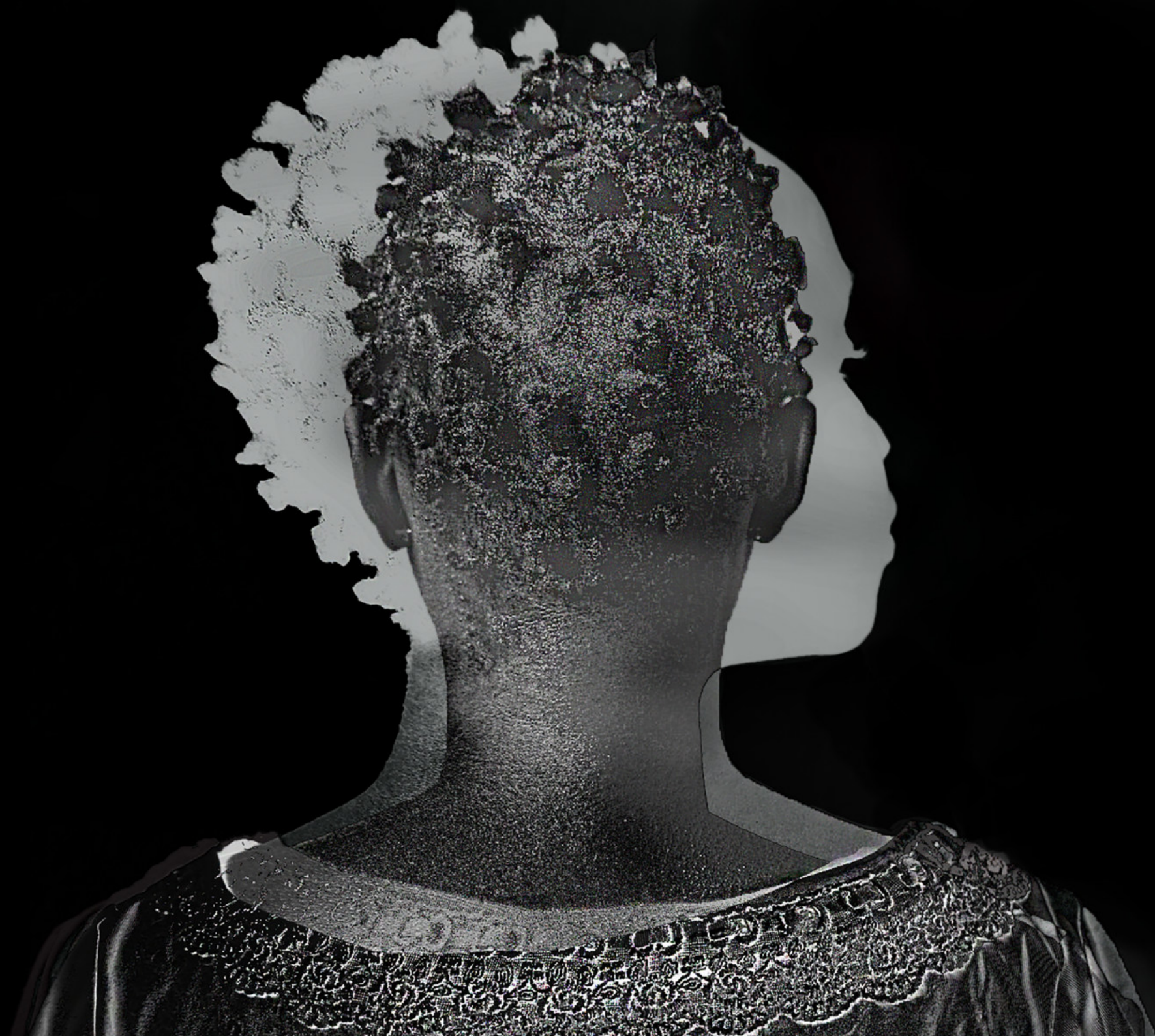
Right: Ongolia Kau, 2023, Digital archive print on canvas, 24 × 36 in | 61 × 91.5 cm