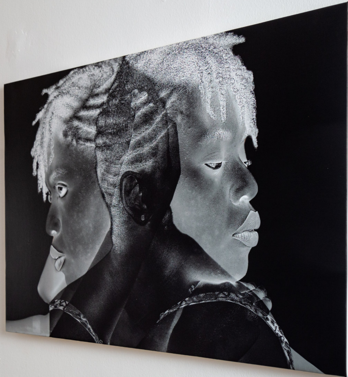
Arauni, 2023, Digital archive print on canvas, 24 × 36 in | 61 × 91.5 cm, Installation view, ECHOES. Amasaka Gallery, Kampala, 2023

The performative process creates a space for self-reflection and growth, providing moments of unapologetically being myself, being inquisitive without having to present solutions.