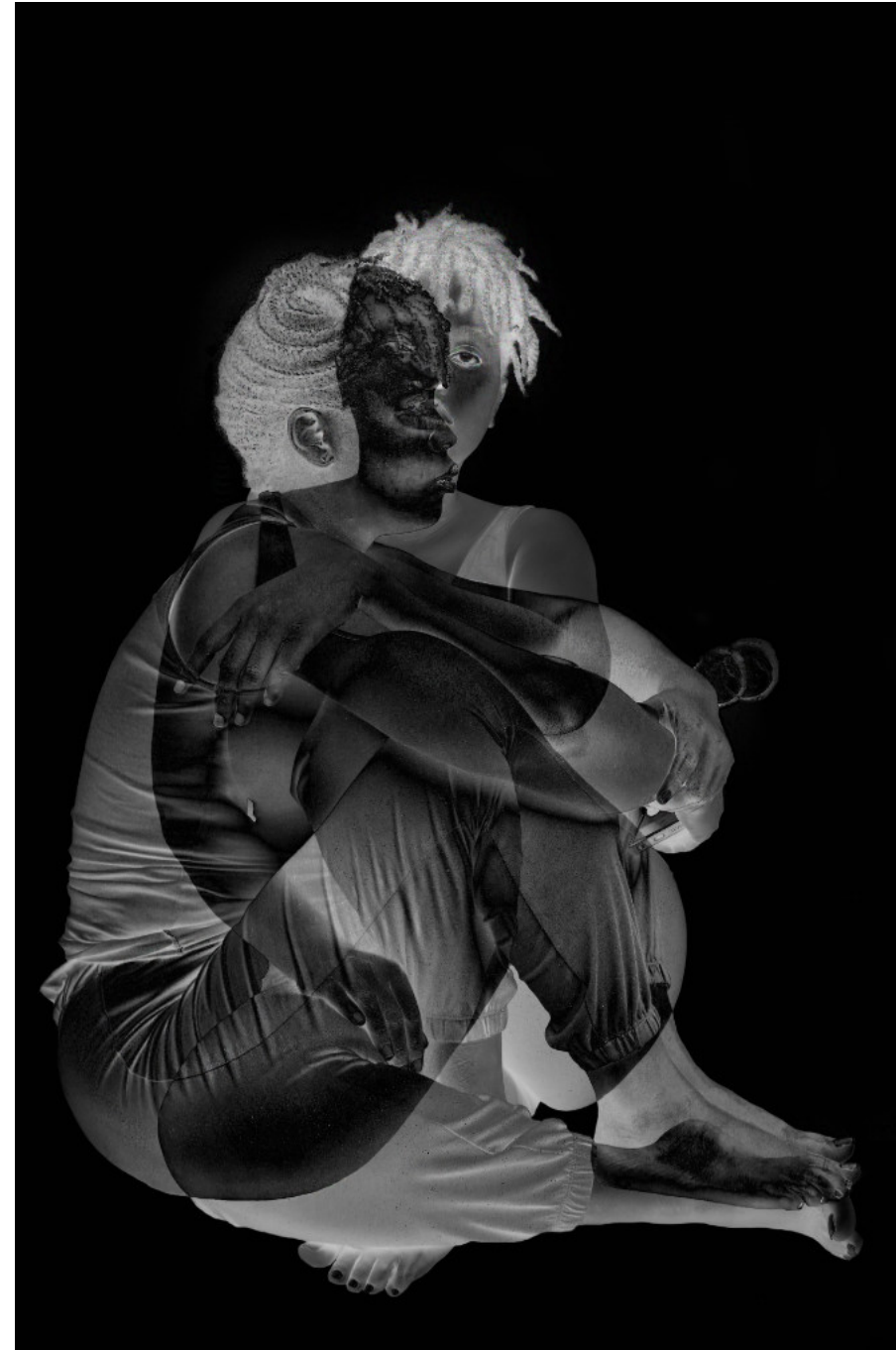
Amuno, 2023, Digital archive print on canvas, 24 × 36 in | 61 × 91.5 cm

9 Questions with Ethel Aanyu, In: Suboart Magazine, Jan 13, 2023