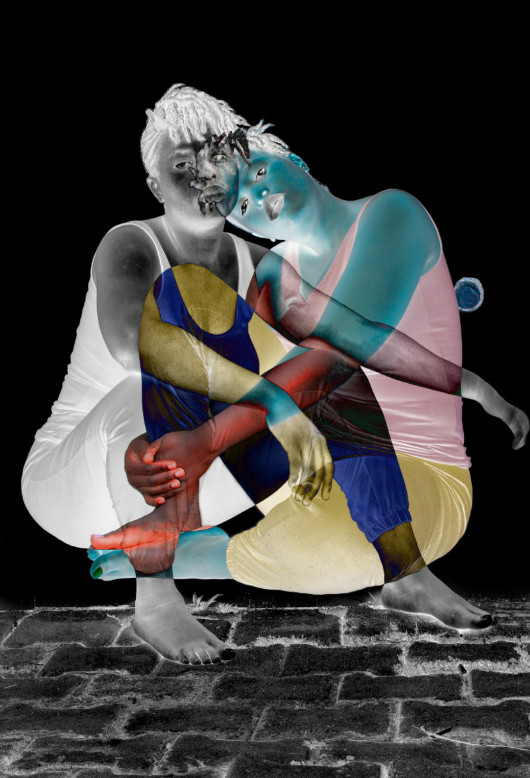
Left: Atikelekari, 2023, digital archive print on canvas, 36 × 24 in | 91.5 × 61 cm