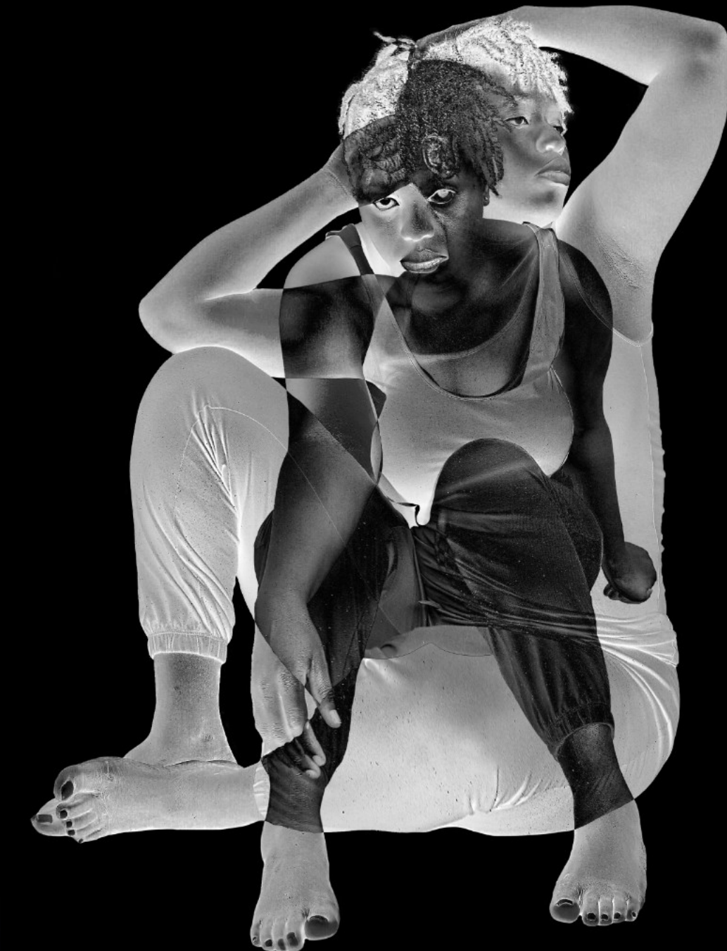
Right: Nikote Nepenen, 2023, digital archive print on canvas, 36 × 24 in, 91.5 × 61 cm